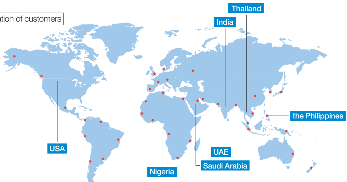
Location of customers

The Fuji Group network enables us to provide fast and timely services to the customers at the same time enabling manufacturers to make use of our overseas group companies services.