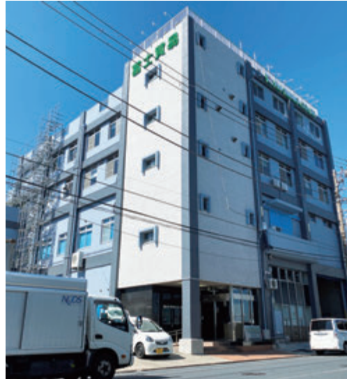
Yokohama Head Office